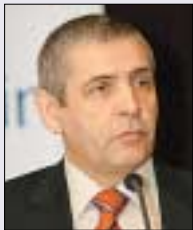
Breakfast forum with Sergey Shatalov, First Deputy Minister of Finance