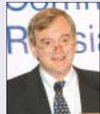
Breakfast forum with Willem Buiter, Chief Economist, EBRD