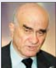
Roundtable with Yevgeny Yasin, Director, RUIE Expert Institute