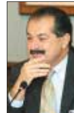
Andrew Liveris Dow

In February 2004 the Chamber launched a new initiative designed to facilitate dialogue between high-level Russian and international executives and to enhance Russia's profile as a prime investment destination. CEO Forums are roundtables between visiting CEOs of global corporations and select corporate leaders in Russia. During the year, six CEOs participated in the series (in order of appearance): Honeywell CEO David Cote , Avaya CEO and Chairman Don Peterson , Hewlett-Packard CEO and Chairman Carly Fiorina , GE CEO Jeffrey Immelt , U.S. Chamber of Commerce CEO Tom Donohue and Dow CEO Andrew Liveris .