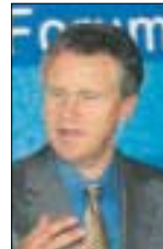
Jeffrey Immelt GE