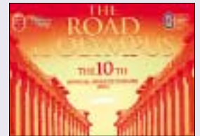
Annual Membership Meeting and 10th Annual Awards Dinner at the Marriott Grand Hotel