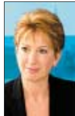
Carly Fiorina Hewlett-Packard