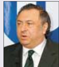
Breakfast forum with Iosif Ordzhonikidze, Deputy Mayor, Moscow City Government, International and Foreign Economic Relations