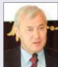
Breakfast forum with Anatoly Aksakov, Vice Chairman of the State Duma Credit Organizations and Financial Markets Committee