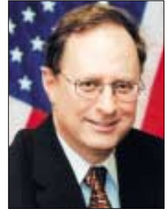
Honorary Chairman Alexander Vershbow U.S. Ambassador to Russia