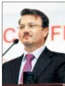
German Gref, Economic Development and Trade Minister