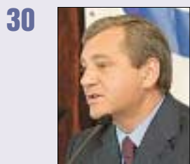
Breakfast forum with Boris Alyoshin, Head, Federal Agency for Industry