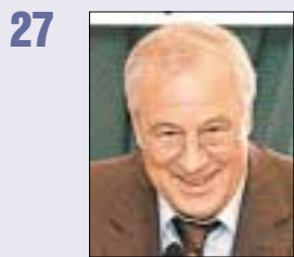
Breakfast forum with Sergey Vevkin-Rokhalsky, Deputy Minister of the Interior