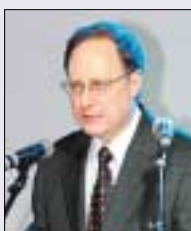
Alexander Vershbow, U.S. Ambassador to Russia