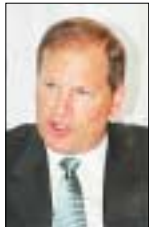
David Cote Honeywell