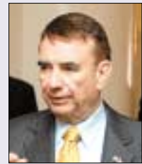
Meeting between Tommy Thompson, U.S. Secretary of Health and Human Services, and AmCham's Healthcare Committee