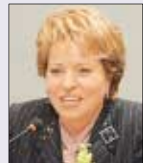
Meeting with Valentina Matvienko, Governor, St. Petersburg