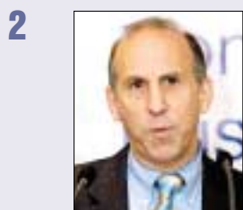
Breakfast forum with James D. Pettit, Consul General of the Embassy of the United States of America