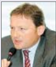
Roundtable with Boris Titov, Chairman, United Business Ethics Commission, RSPP