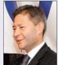
Breakfast forum with Leonid Reiman, Minister of Information Technologies and Communications