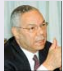
Breakfast roundtable with Colin Powell, U.S. Secretary of State