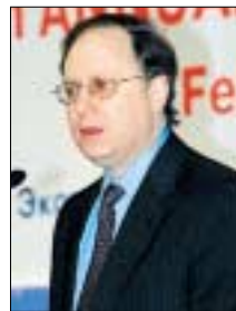
Alexander Vershbow, U.S. Ambassador to Russia

Bringing together more than 250 Russian and international business leaders and government officials, as well as more than 60 media representatives, the 5th Annual AmCham Investment Conference served as an opinion-leading forum for discussion and debate on Russia’s developing market economy and progress in creating an investment-friendly environment. Featuring a keynote address by Minister of Economic Development and Trade German Gref, the day’s agenda was filled with updates by corporate and government leaders on individual sectors, including energy and information technology. As always, delegates received a copy of the Economy and Investment Climate in Russia , an insightful annual analysis of the previous year’s events and their immediate and long-term impact on the investment climate. The report was jointly prepared by AmCham and the Expert Institute of the Russian Union of Industrialists and Entrepreneurs (RSPP).