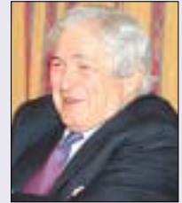
Closed meeting with James Wolfensohn, President, World Bank