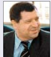
Breakfast forum with Leonid Lozbenko, First Deputy Chairman, State Customs Committee