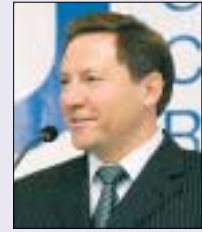
Regional Forum with Oleg Korolyov, Governor, Lipetsk Oblast